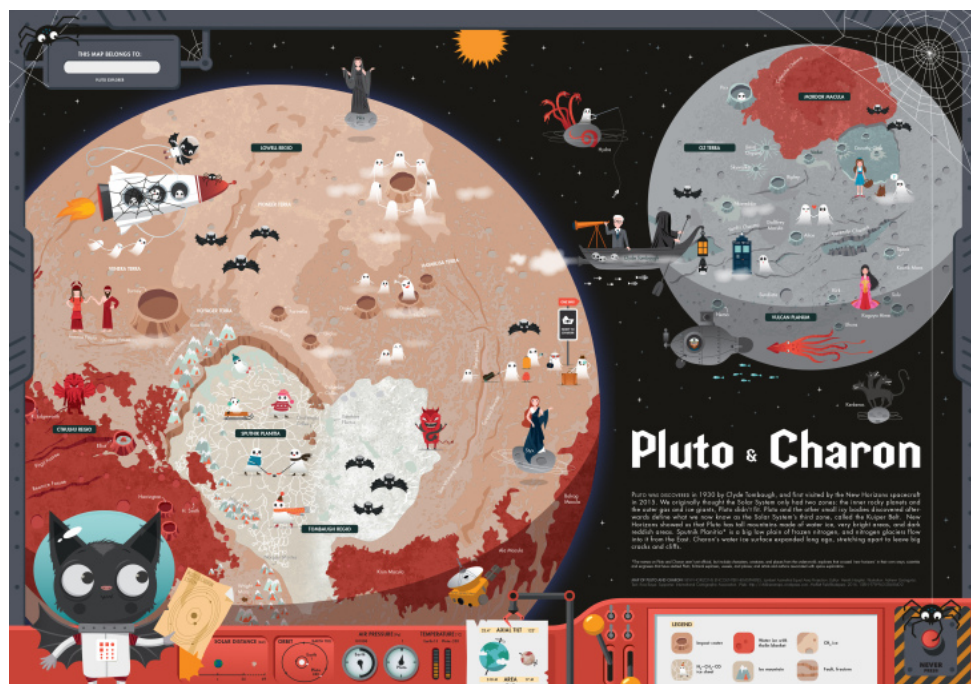
Figure 1 Example Children's Planetary Maps used in the Europlanet astroEDU collection