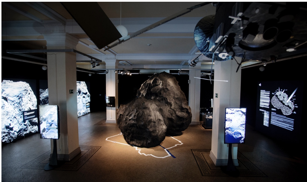
Figure 6: images of the “Comets – The Rosetta Mission” Exhibition at the Museum für Naturkunde, Berlin.