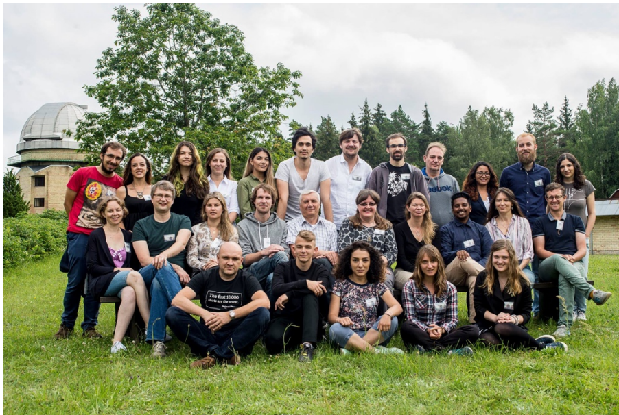
Figure 11: Students and tutors at the Europlanet Summer School 2017 in Moletai, Lithuania.

Europlanet 2020 RI’s outreach activities have placed a particular emphasis on engagement with countries that are currently under-represented in the European planetary science