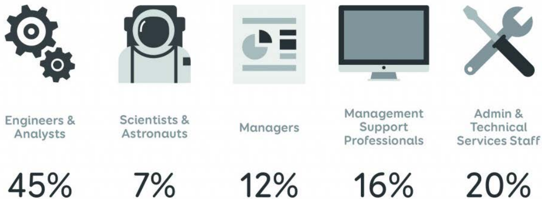
Figure 13: Careers graphic produced by Europlanet for European Parliament Information Office in Slovenia