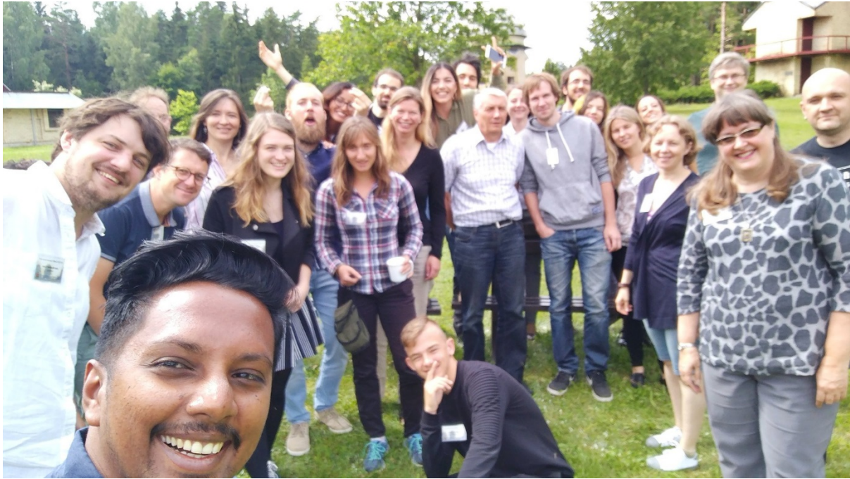
Figure 2 Students and tutors at the Europlanet Summer School in Moletai, Lithuania.