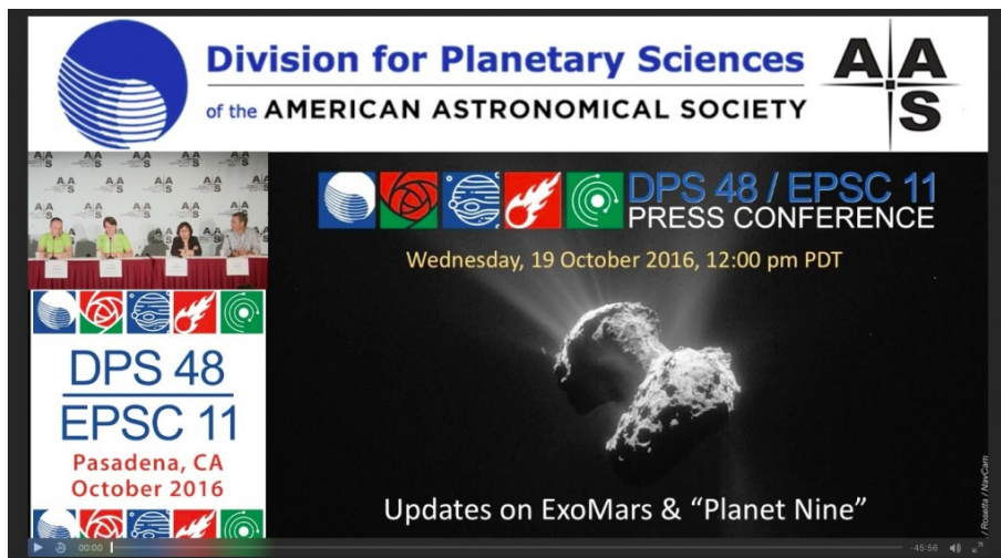
Figure 7: Still from webcast of press briefing at DPS-EPSC Joint Meeting