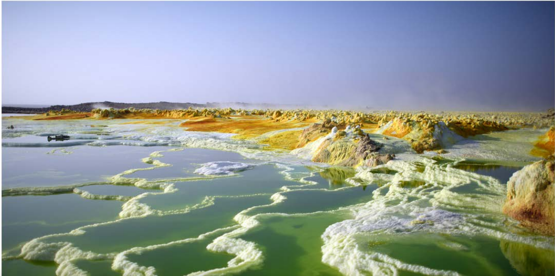
Figure 12: Screenshot of New York Times article on Europlanet field trip to the Danakil Depression