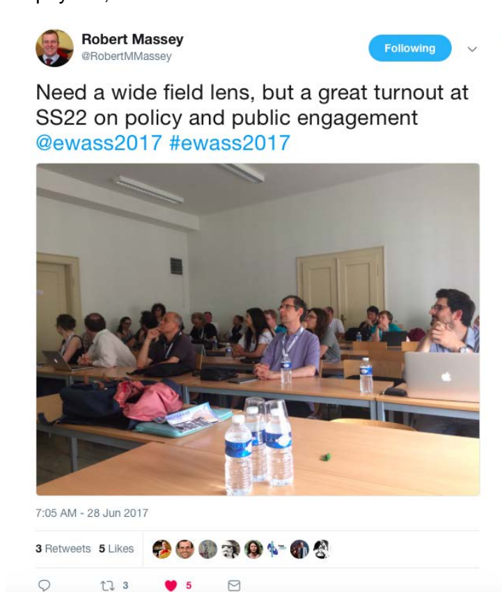
Figure 3 Twitter coverage of Europlanet/RAS session at EWASS 2017