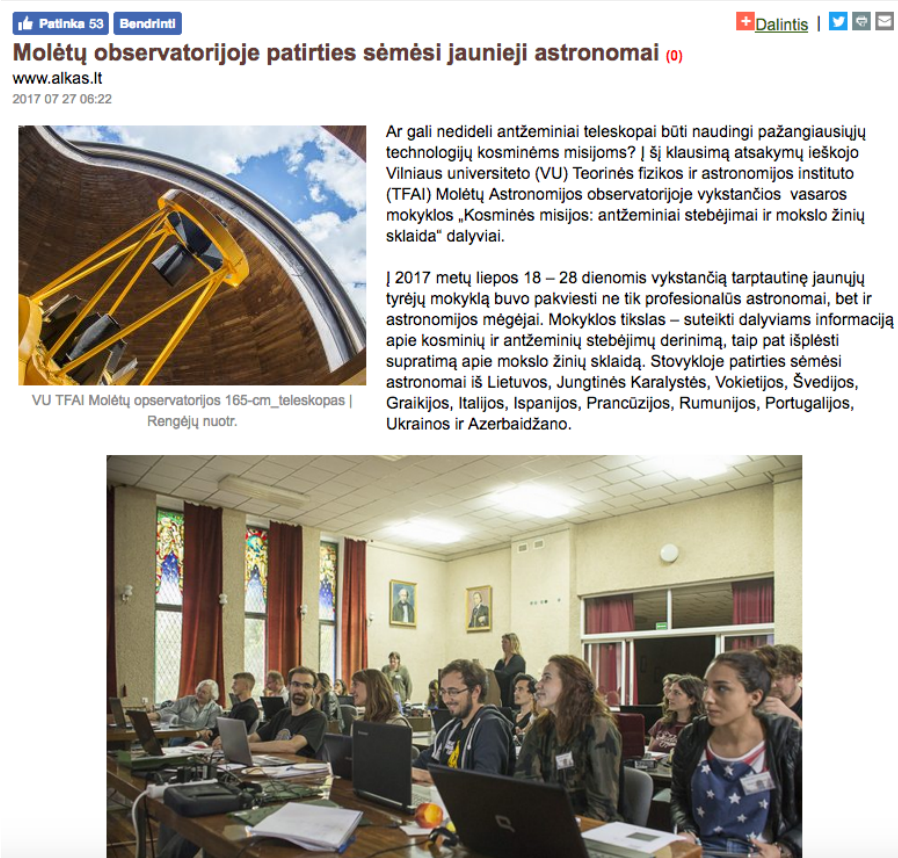
Figure 5: Screenshot of story published on Lithuanian news site sourced from press release written by students as part of the science communication training at the Europlanet Summer School