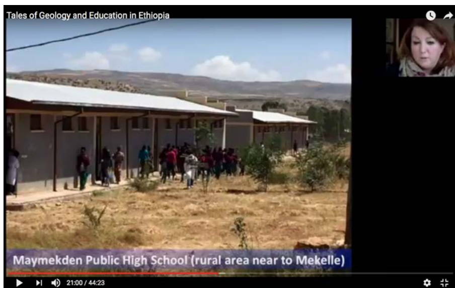
Figure 8: Still from Europlanet webinar featuring Dr Barbara Cavalazzi speaking on 'Tales of Geology and

EPN2020-RI's social media presence is managed by Thilina Heenatigala of Science Office. Europlanet maintains a social media presence on Facebook , Twitter , Instagram , Flickr and YouTube .