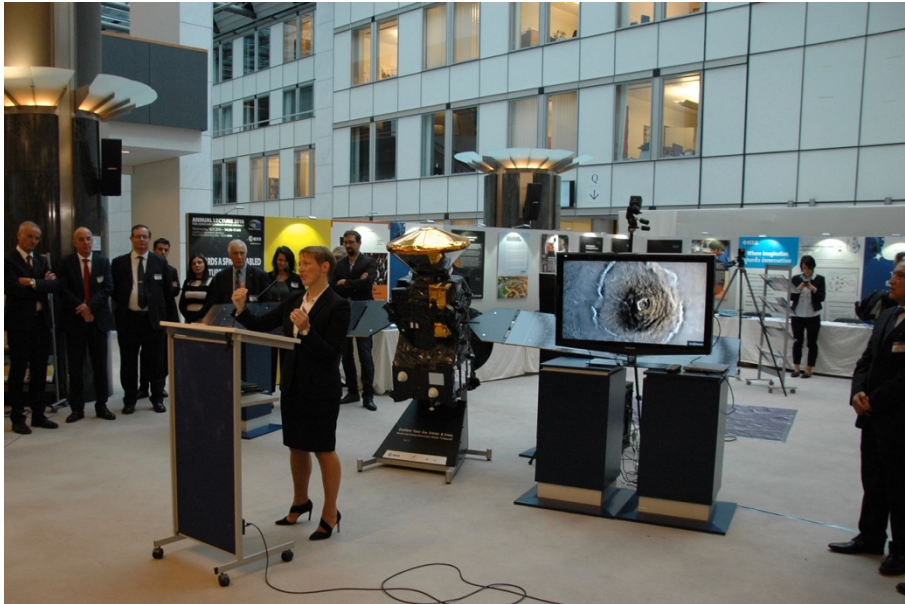
Figure 9: MEP Clare Moody speaking at the opening of the exhibition in the European Parliament