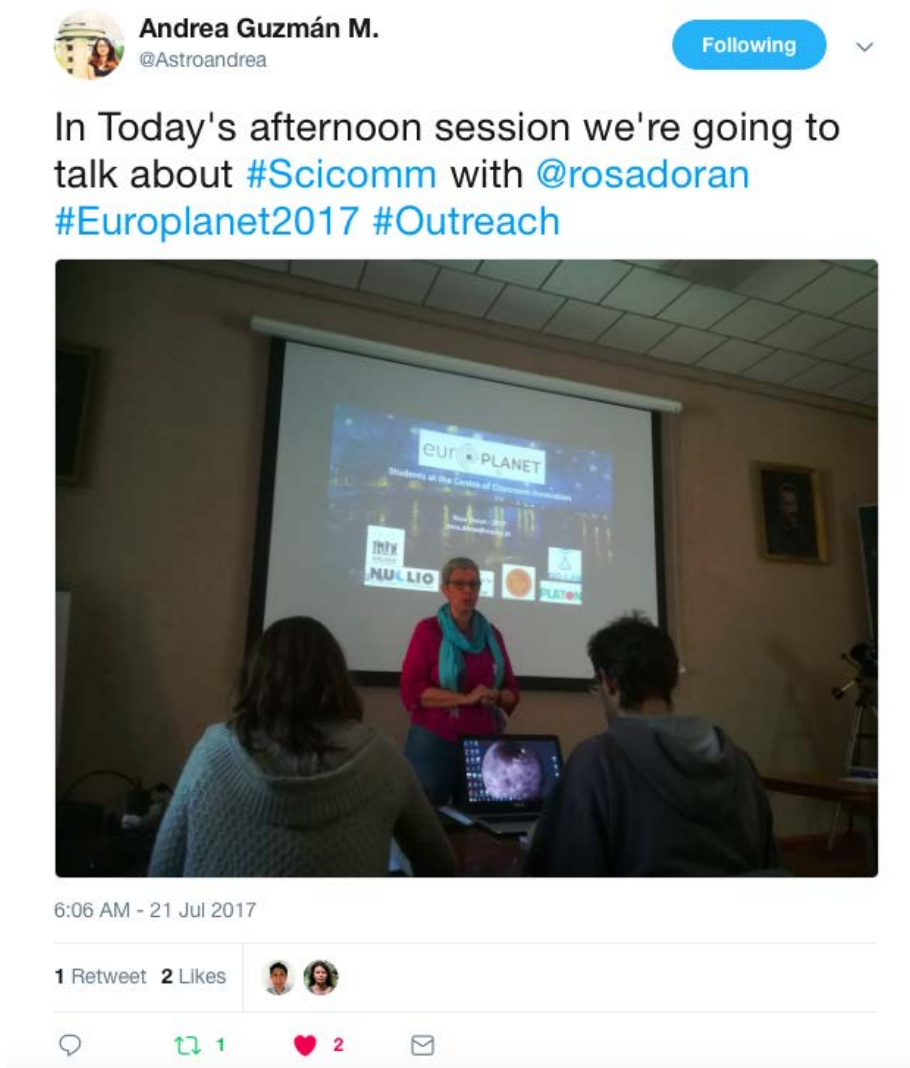
Figure 4: Tweet from student participating in Science Communication training at Europlanet Summer School