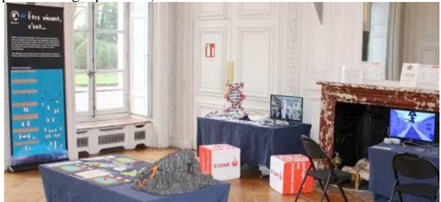
Figure 4: Europlanet 2020 RI's Astrobiology video was used by S[Cube] as part of a touring exhibition and for schools events

• To date, we estimate that the videos overall have had at least 112 000 views (around 62,000 through Europlanet and Science Office channels and 50,000 through sharing of the videos on other platforms e.g. Space.com).