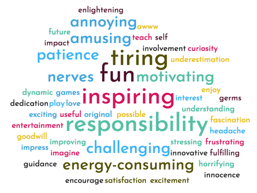
Figure 5: Responses to the idea of working with schools gathered from participants at Europlanet Summer School 2019 using the "Three words" tool from the Europlanet Evaluation Toolkit

The toolkit was used by trainers at the Europlanet Summer School 2019 to gather information on where students came from (Tool 5. Geographic Location Maps), their experience of outreach and working with schools (Tool 1. Physical Ranking Scale), their responses to the idea of working with schools (Tool 9. Three Words, Analysis Tool 1. Word Clouds, Analysis Tool 2. Thematic Coding), their aim to follow up on educational activities in the future (Tool 4. Palm on Chest) and their overall evaluation of the workshop (Tool 11. Post Event Survey).