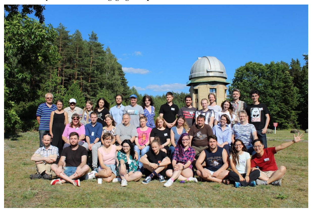
Figure 6: Students and tutors at the Europlanet Summer School 2019 in Moletai, Lithuania.

NA2 tracks the gender balance of all its outputs. In Year 4 of the project, 24% of researchers quoted or mentioned in the main text of press releases issued by the Europlanet Media Centre were female, 22% of researchers participating in press briefings at EPSC 2018 were female (2/9), 43% of the talks streamed during EPSC had a female presenter (20/46), 50% of guests on Europlanet's webinars (4/8) were female, as were 50% of Facebook interviewees (7/14). The gender balance in the webinars and interviews reflect the situations where the Europlanet team has full control over the reflection of the line-up. The aim of the Facebook interviews was to show role models to young people and the interviewees reflect a range of backgrounds and ethnic diversity within the community.