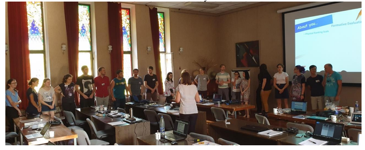
Figure 1: Students at the Europlanet Summer School 2019 use the "Physical Ranking Scale" to show how much experience they have with engaging with schools, from none (left) to a lot (right).

Following the success of the Europlanet Summer Schools in 2017 and 2018, an additional Summer School was held at the Moletai Astronomical Observatory from 11-21st June 2019.